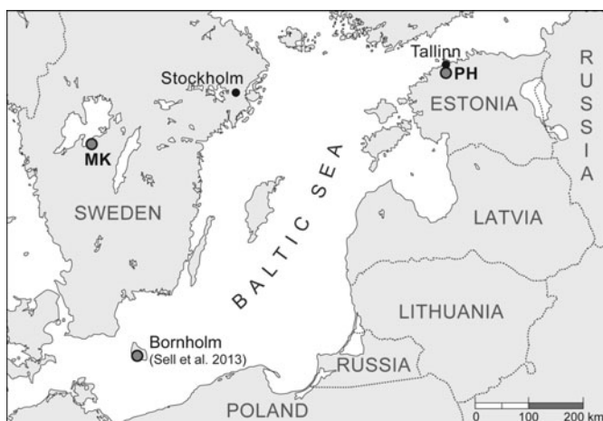
Fig. 2. Index map for the sample localities of MK and PH from Mossen at Kinnekulle in southern Sweden and Pääsküla Hillock at Tallinn in northern Estonia.

Individual zircon grains were easily separated, because both K-bentonite samples of MK and PH were soft/plastic. Euhedral ca. 120- \mu\text{m} -long single grains were hand picked, 25 grains from MK and 30 from PH, respectively. Using cathodoluminescence visual imaging, we selected micro-domains of zircon crystals with oscillatory zoning that is unique to igneous zircons (Corfu